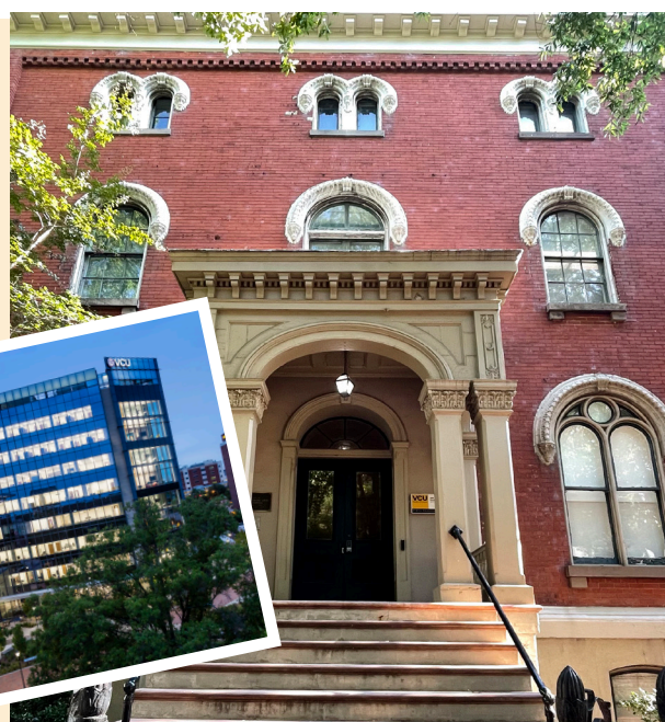
The Grant House today. (Inset) The new College of Health Professions building on the VCU campus.